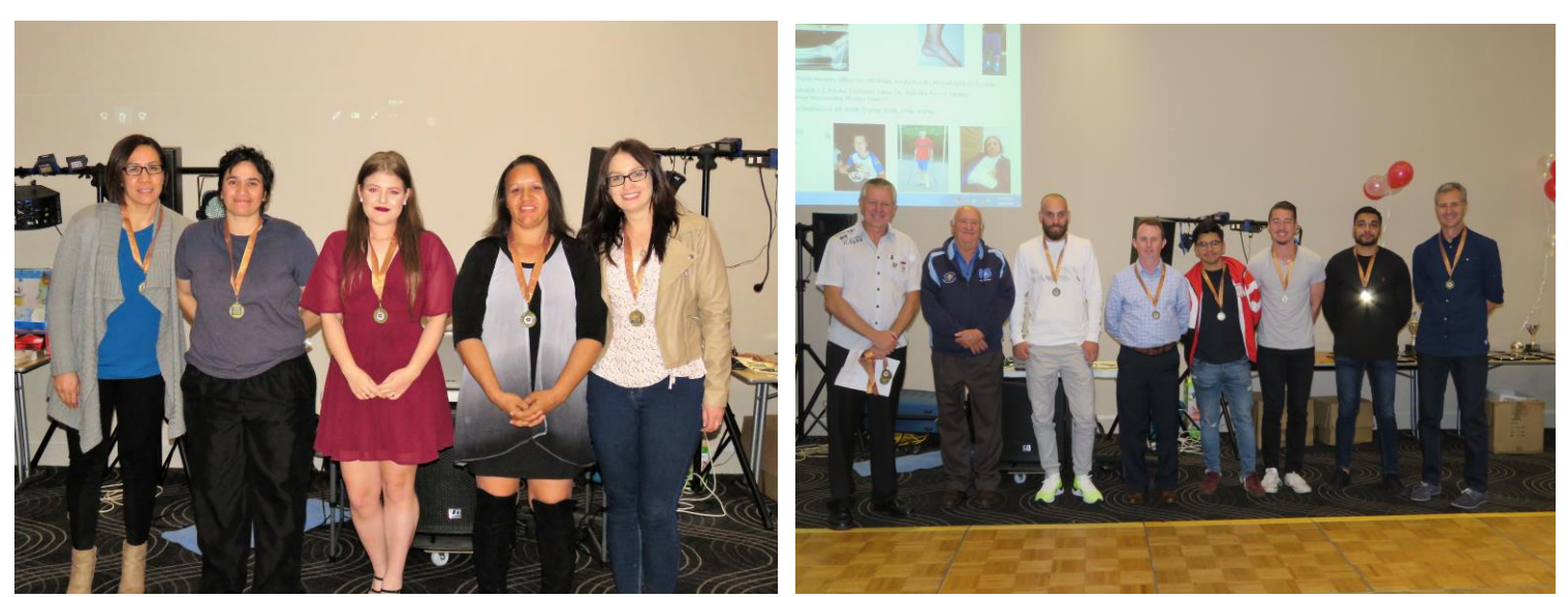
Ladies and Men All stars as chosen by you!