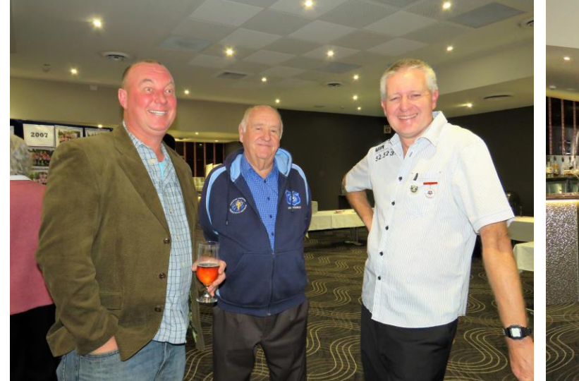
Great to have some 1999 originals to catch up with