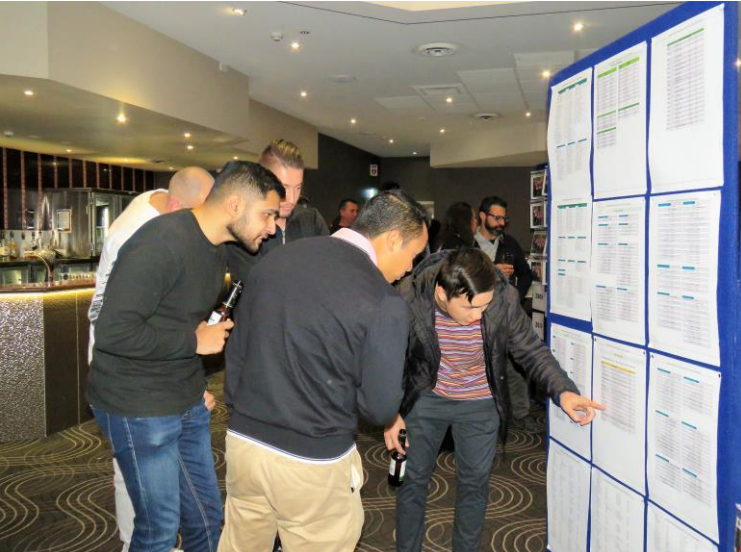
The PL boys read of past glories