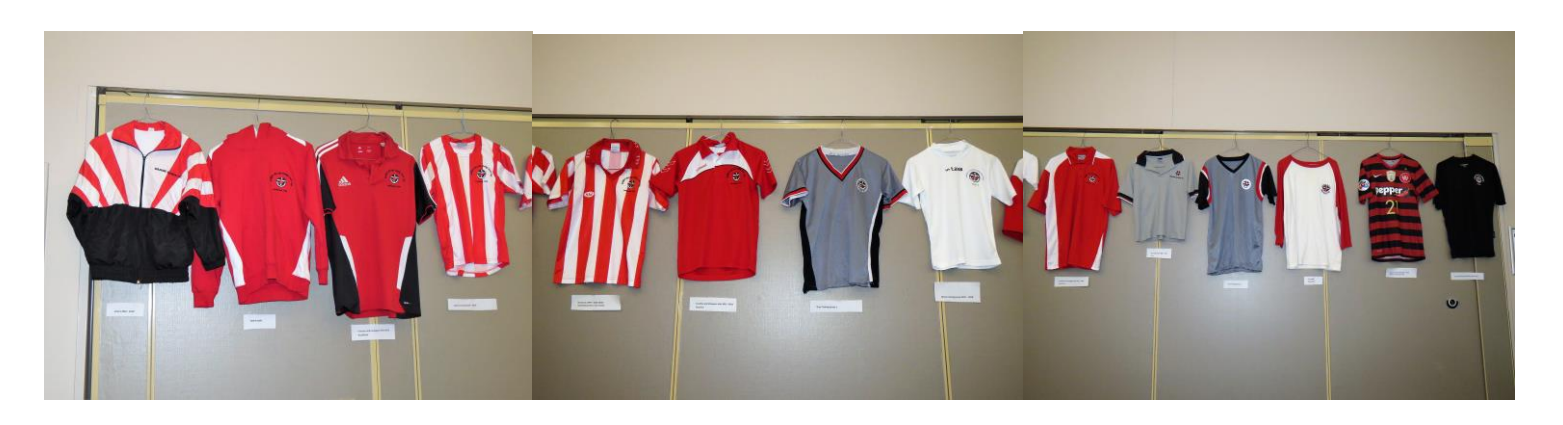
The longer you have been around, the more of these you will recognise