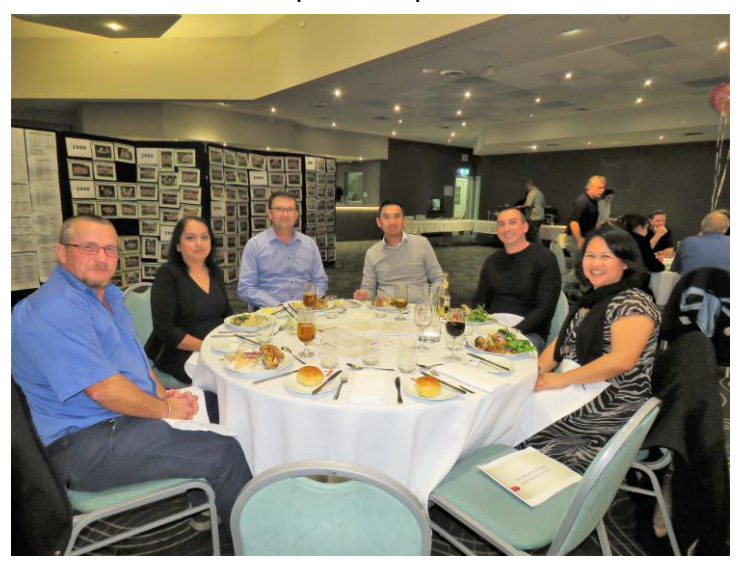
Some of the junior team representatives