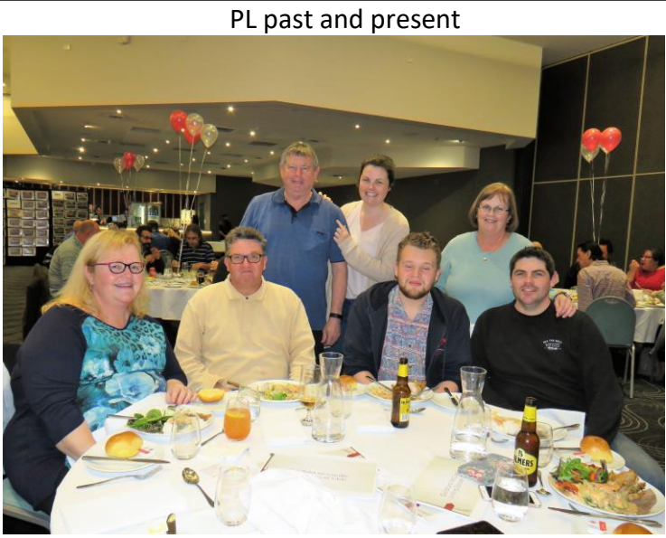
Life members and families that have given so much to our club