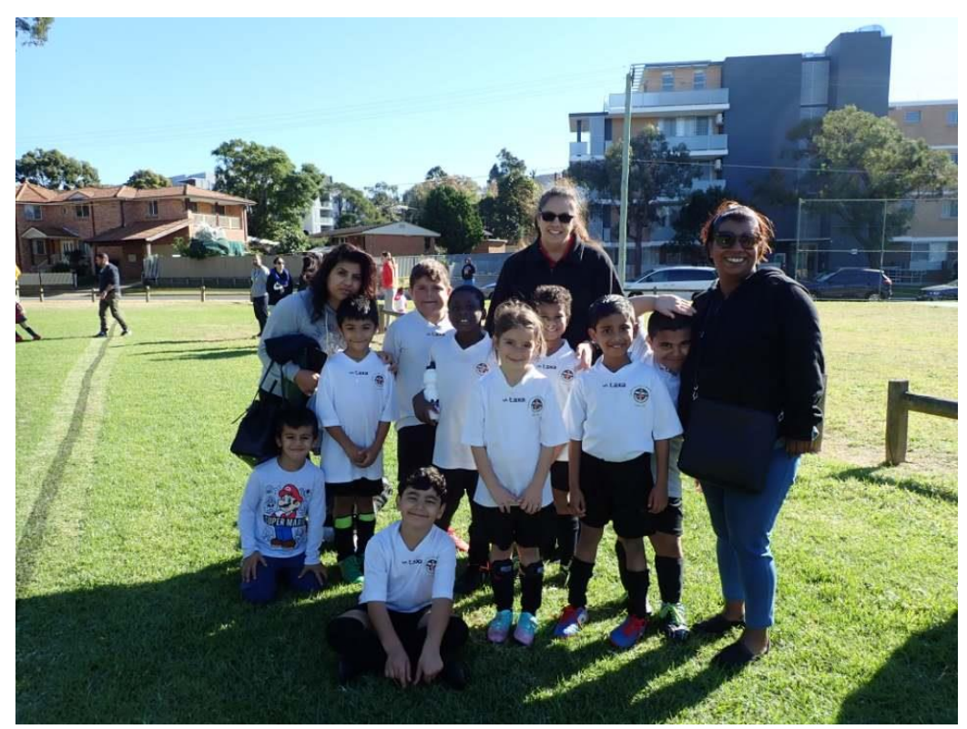
Happy Mother's Day from the 7 Whites!

Goal scorers: Jeremias Ezenwa-Ndukaky 3, Kayra Mete 2