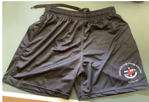
Shorts $28 – all sizes available

It's getting cold - we have jackets & Hoodies for sale. Available from the canteen