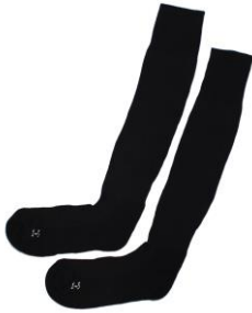
Socks - $12