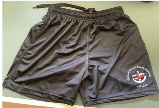
Shorts $28 – all sizes available

It's getting cold - we have jackets & Hoodies for sale. Available from the canteen