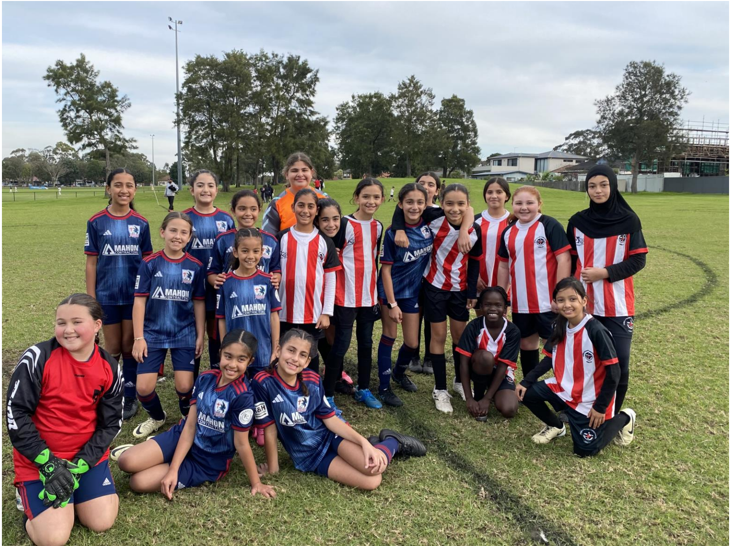
U11 Girls reminding us all what this is all about!